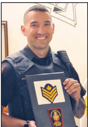
Two officers promoted from 1 MP PI Page 4