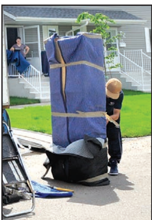
Summer means posting season underway Page 4