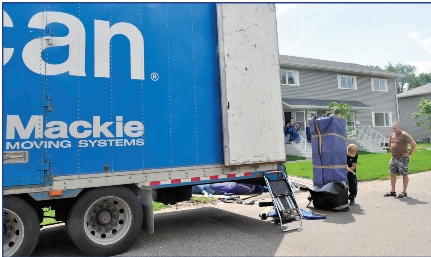
During the summer months on the Base you can't miss the large moving vans parked out front of a PMQ as workers either unload items for someone moving in, or load for a family posting out.

When you first open the www.bgrsguide.bgrs.ca website,