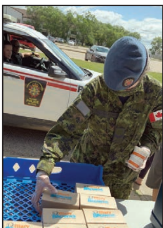
Focused on Base summer events Page 8