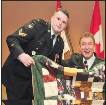
Man in Motion presents Sacrifice Medal. Page 3