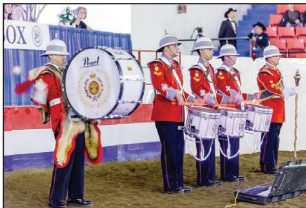
2PPCLI's Drum Line performed during the opening of the annual Royal Manitoba Winter Fair in Brandon.