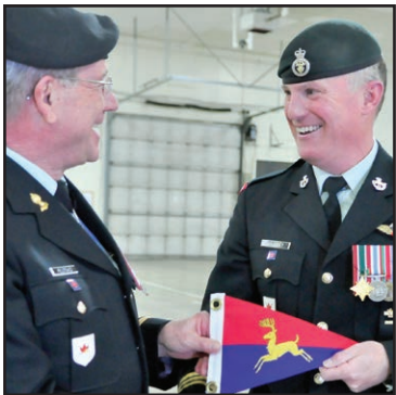
BComd receives special pennant. Page 2