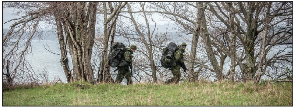
3PPCLI soldiers, with 1RCHA's Z Bty accompanying them during Ex SPARTAN TRIDENT, patrol along the Vancouver Island shoreline near Victoria.

770 Highland Ave, Brandon 204.729.8989 1.800.751.8899 aats.ca