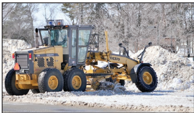
A Base Transport grader cleared a thick crust of ice from the rear parking lot of CANEX. Other areas on the Base will receive the same treatment with the advent of spring, and melting of this past winter's snow/ice buildup.