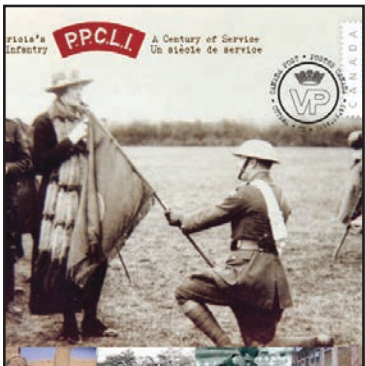
Canada Post honours PPCLI. Page 6