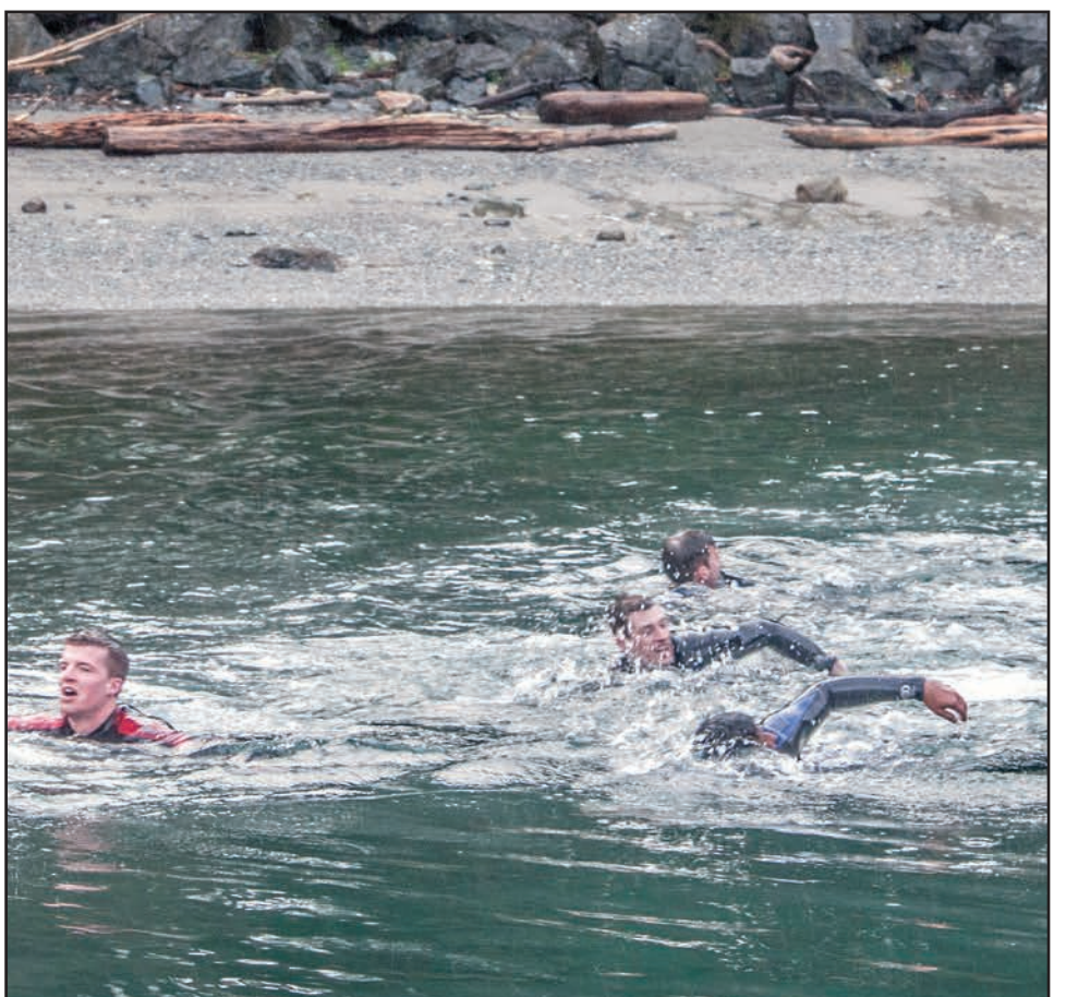
Artillery and infantry soldiers alike learned the ocean off of Vancouver Island was frigid once they jumped from a Sea King helicopter or dived from a moving Orca training vessel as part of Ex SPARTAN TRIDENT.