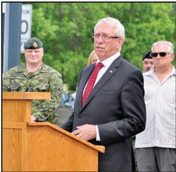
Infrastructure announcement made at CFB Shilo. Page 8