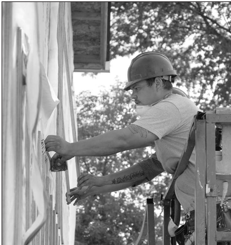
Work on replacing old RHU siding is underway this summer as part of improvements to CFB Shilo's RHUs. Here, two workers prepare an exterior wall on a duplex for the new siding.

This, combined with CFHA's regular funding will result in more renovated houses and new construction. This includes CFB Shilo.