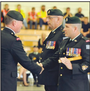
BRSM looking forward to his new job at HQ. Page 2