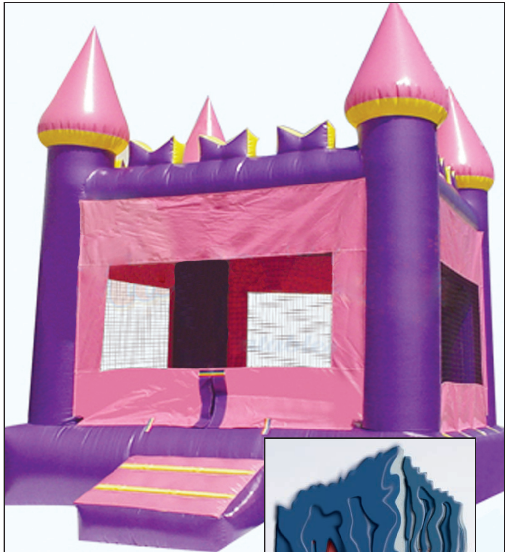
Soft walls and a bouncy floor await Shilo firefighters at their new portable fire tower, above. An unseasonable mild winter is thought to be at fault after the top half of the current burn tower (at right) started to melt away on April 1.