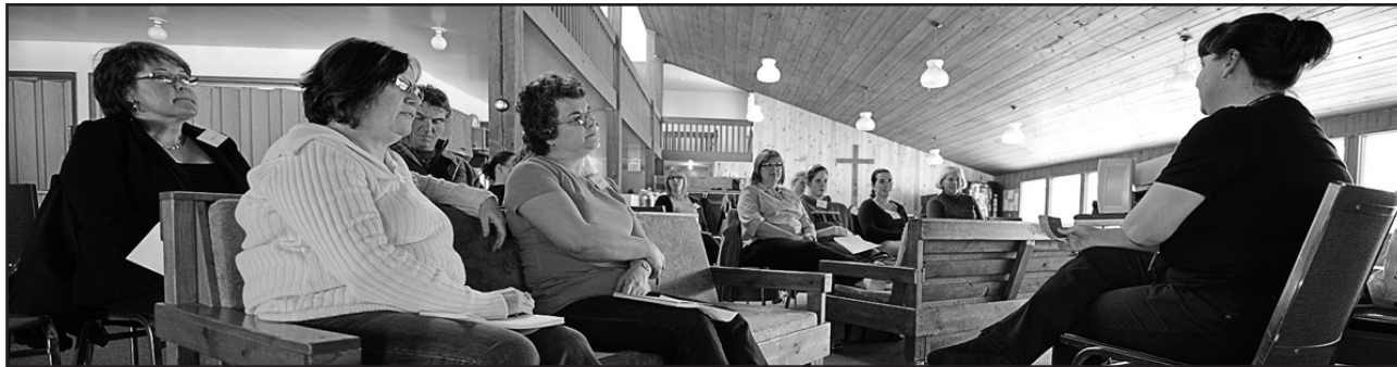
Seven MFRC members from Shilo took part in a recent R & R Retreat in Winnipeg.