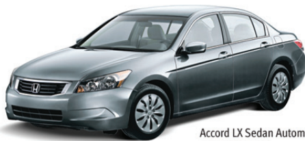
Accord LX Sedan Automatic model CP2F3AE

PER MONTH FOR 48 MONTHS WITH $2,440 DOWN ON APPROVED CREDIT Includes $1,395 Freight & PDI