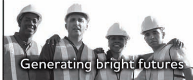
Generating bright futures

Manitoba Hydro is committed to diversity and employment equity.