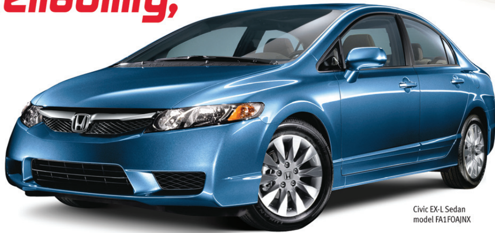
Civic EX-L Sedan model FA1FOAJNX

Purchase Financing as low as 0.9% † FOR 5 YEARS