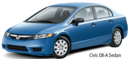
Civic DX-A Sedan model FA1E2AE4X

Purchase Financing as low as 0.9% † FOR 5 YEARS