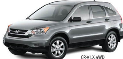
CR-V LX 4WD model RE4H3AEY

PER MONTH FOR 48 MONTHS WITH $3,732 DOWN ON APPROVED CREDIT Includes $1,550 Freight & PDI