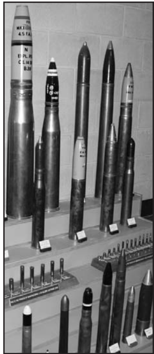
An assortment of shells are displayed at the RCA Museum.