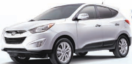
Limited model shown

OWN IT $140 † WITH 0% BI-WEEKLY PAYMENT FINANCING FOR 72 MONTHS AND NO DOWN PAYMENT TUCSON L 5-SPEED, DELIVERY & DESTINATION INCLUDED.