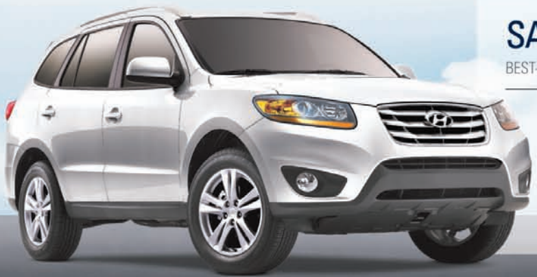
Limited model shown

OWN IT $140 † WITH 0% BI-WEEKLY PAYMENT FINANCING FOR 72 MONTHS AND NO DOWN PAYMENT TUCSON L 5-SPEED, DELIVERY & DESTINATION INCLUDED.