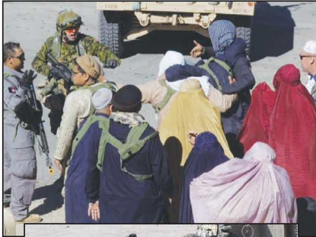
Whether it was talking to actors portraying Afghan villagers at left or under siege at bottom, C Coy played a big role in Ex KAPYONG SUE.

During the first week of operations, dubbed the stands week, 1/11 ACR with C Coy were given the task of attacking several 1/25th positions. The combined force attacked mountaintop coy defensive positions known as combat outposts (COPs). C Coy braved difficult mountain terrain and extensive wire obstacles to overrun