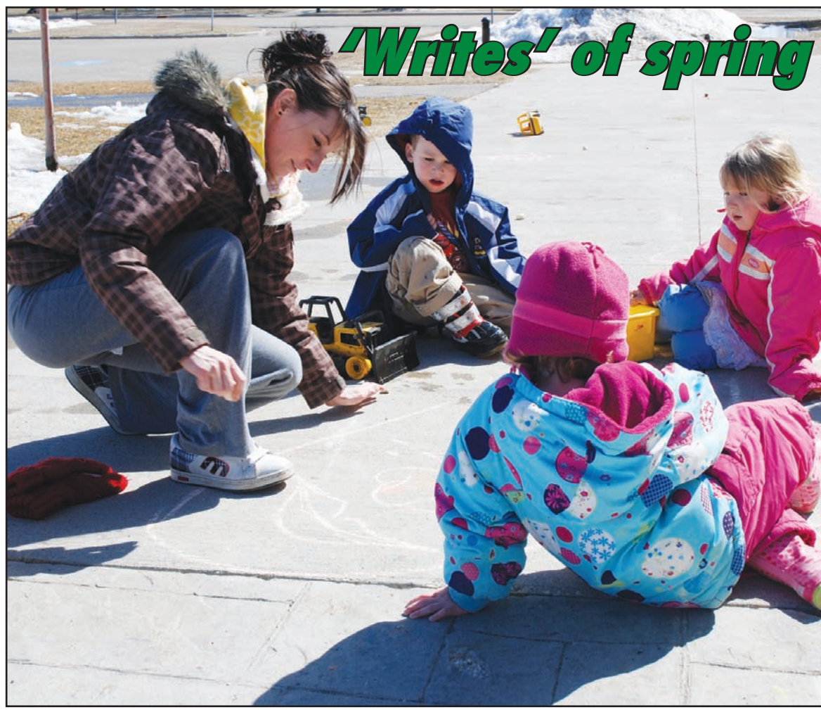
After a long, cold winter at CFB Shilo it didn't take much to get youngsters out enjoying the spring air. This group outside the MFRC daycare was busy making chalk drawings on the pavement on April 12.