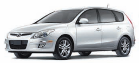
GLS Sport model shown

ELANTRA TOURING HIGHWAY 6.5L/100 KM – 43 MPG*