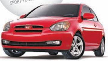
GL Sport model shown

NO CHARGE UPGRADE SUNROOF, FOG LIGHTS, 16" ALLOY WHEELS, SPORT-TUNED SUSPENSION