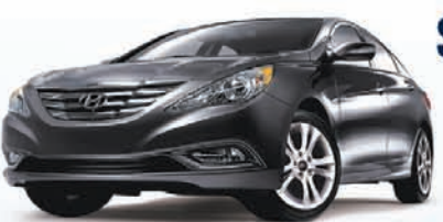
Limited model shown

OWN IT $134 † WITH 0% BI-WEEKLY PAYMENT FINANCING FOR 84 MONTHS AND NO DOWN PAYMENT SONATA GL 6-SPEED, DELIVERY & DESTINATION INCLUDED.