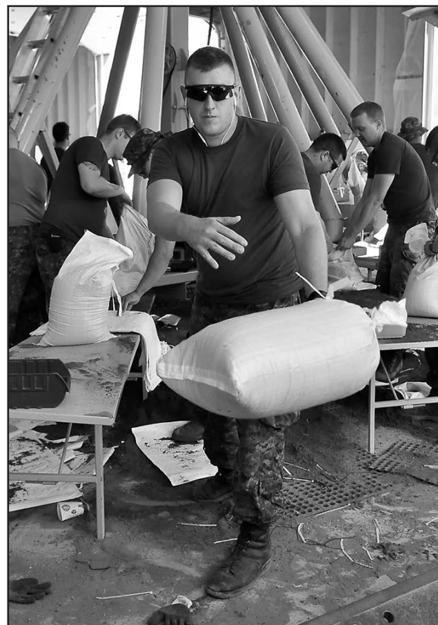
1RCHA soldiers filled plenty of sandbags during Op LENTUS to help with flooding.

The following is a paid advertorial for SISIP Financial Services