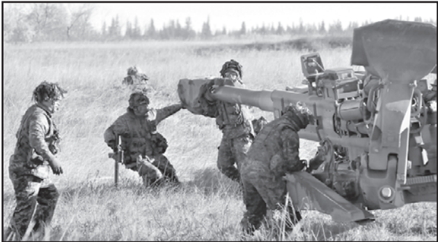
The British observed 1RCHA in action with the M777 as part of Ex LIMBER GUNNER.