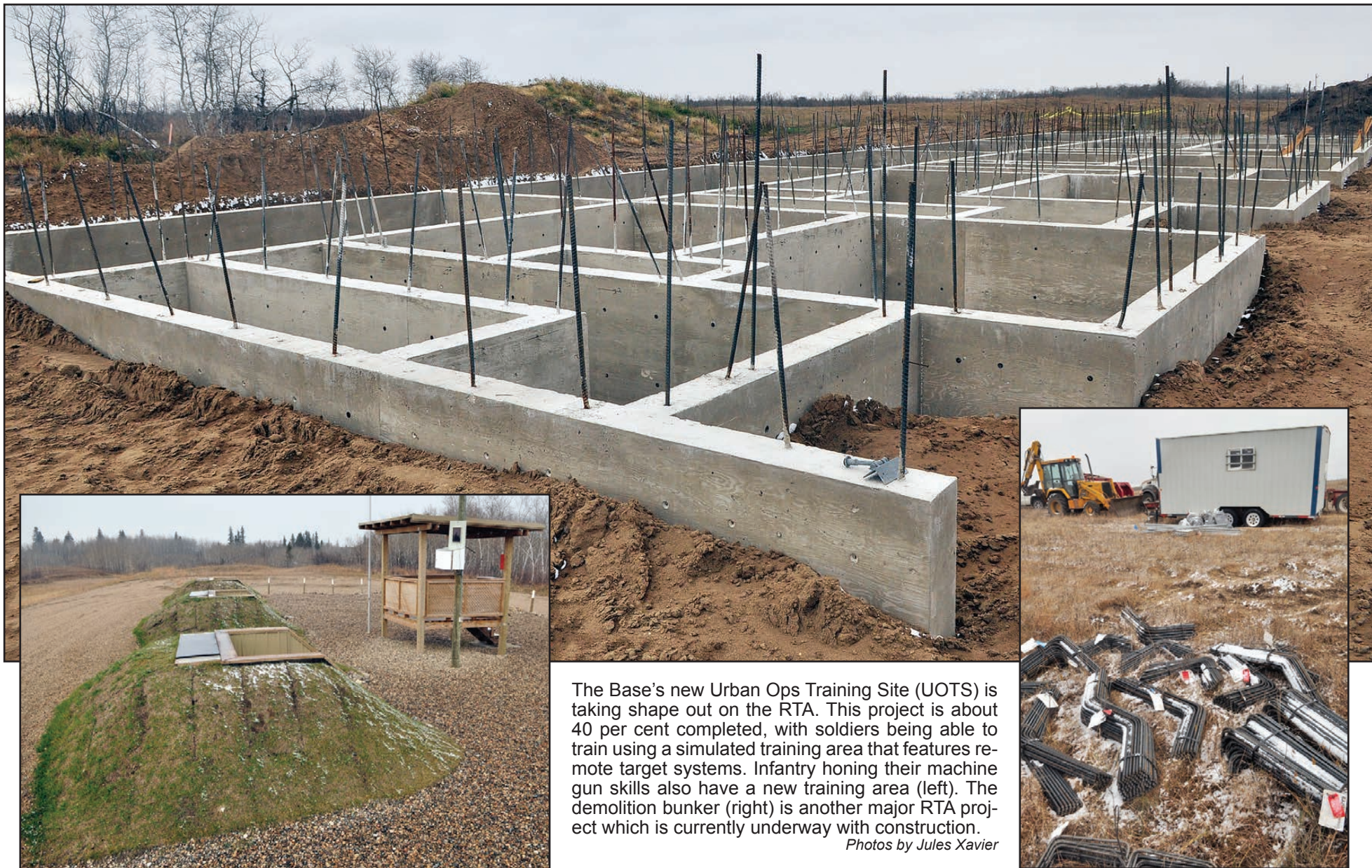
The Base's new Urban Ops Training Site (UOTS) is taking shape out on the RTA. This project is about 40 per cent completed, with soldiers being able to train using a simulated training area that features remote target systems. Infantry honing their machine gun skills also have a new training area (left). The demolition bunker (right) is another major RTA project which is currently underway with construction.