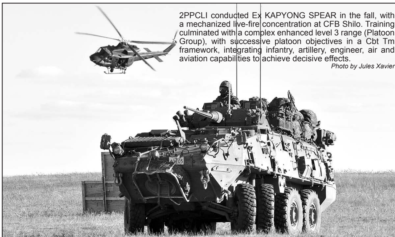
2PPCLI conducted Ex KAPYONG SPEAR in the fall, with a mechanized live-fire concentration at CFB Shilo. Training culminated with a complex enhanced level 3 range (Platoon Group), with successive platoon objectives in a Cbt Tm framework, integrating infantry, artillery, engineer, air and aviation capabilities to achieve decisive effects.