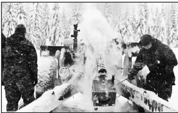
A gun fires a target specifically to protect the Canadian Pacific Railway.

In partnership with Parks Canada, this largest avalanche control program in the world named OP PALACI began in 1962. Parks Canada personnel know the recipe for a perfect avalanche. Their forecasting and daily snow analysis, along with our keen and efficient Gunners, come together as the perfect team for what the Parks Canada folk like to call, the 'Snow War.' Operational dangers for all working along the closed highway are different every time. This year marked a close call for a Parks Canada staff member as he and his vehicle were swept away in an avalanche. Luckily, no one was