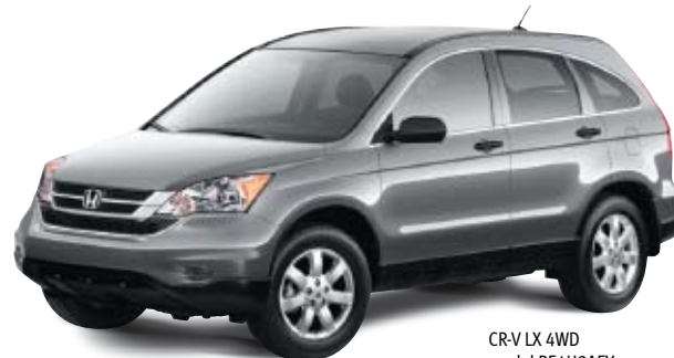
CR-V LX 4WD model RE4H3AEY

LEASE FOR / APR $298 # @ 2.9% £ PER MONTH FOR 48 MONTHS WITH $3,732 DOWN ON APPROVED CREDIT Includes $1,550 Freight & PDI