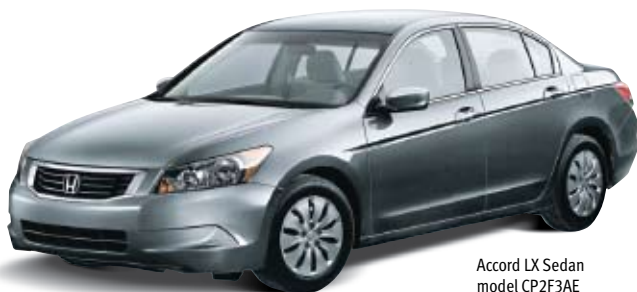
Accord LX Sedan model CP2F3AE

LEASE FOR / APR $198 # @ 2.9% £ PER MONTH FOR 48 MONTHS WITH $2,440 DOWN ON APPROVED CREDIT Includes $1,395 Freight & PDI