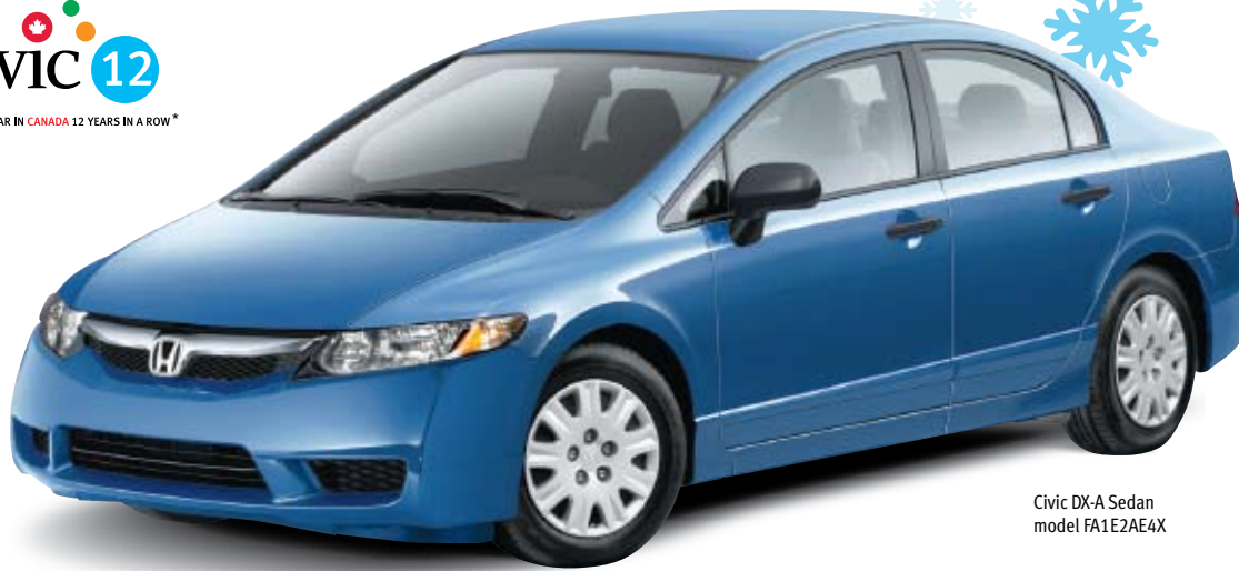
Civic DX-A Sedan model FA1E2AE4X

BEST SELLING CAR IN CANADA 12 YEARS IN A ROW*