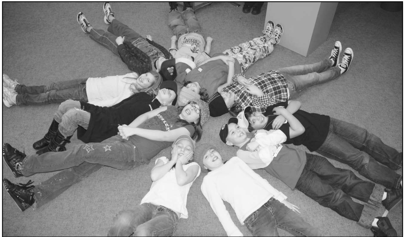
Grade 4, 5 and 6 students at O'Kelly School are pictured with their hats following a Hats For Haiti campaign which raised $1,711 locally.