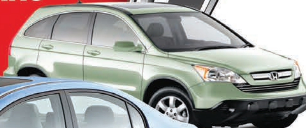
CR-V EX-L model RE48791N