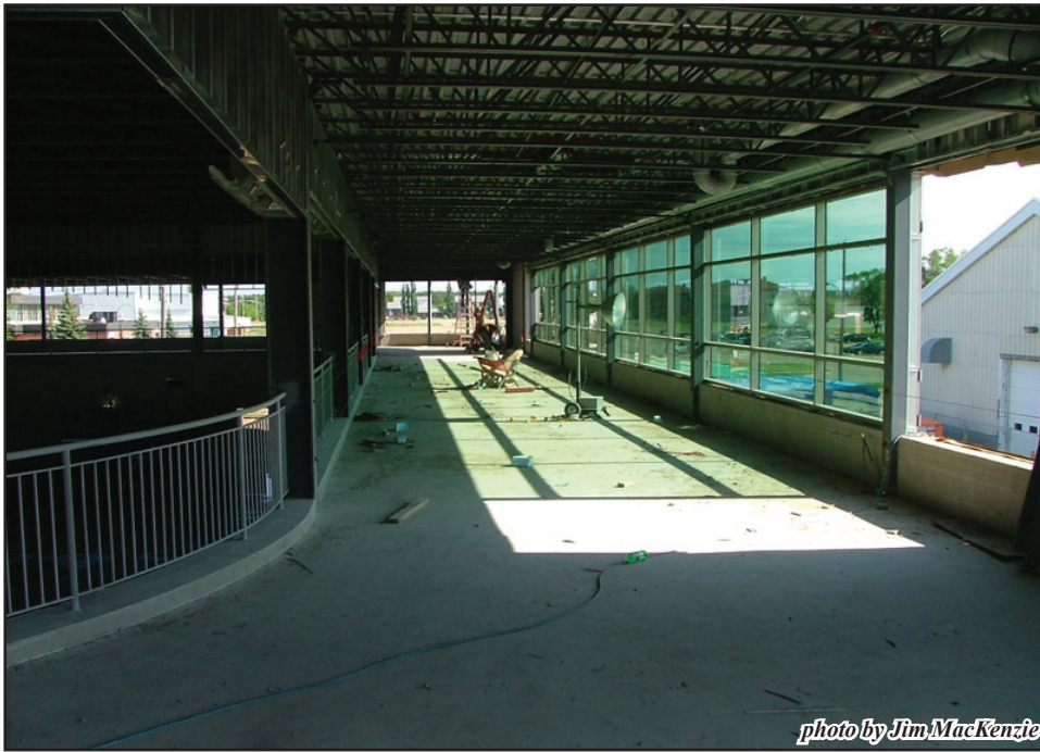
Construction continues on the new elevated 200m running track at the General Strange Hall.

Because this project includes both new construction