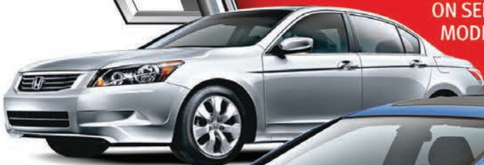
Accord EX-L V6 model CP36891N