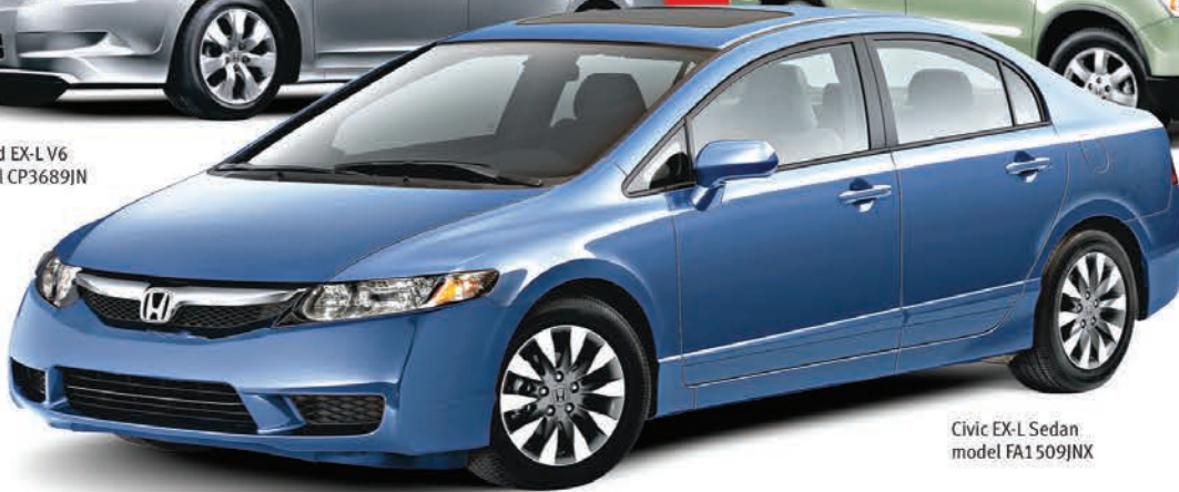
Civic EX-L Sedan model FA15091NX