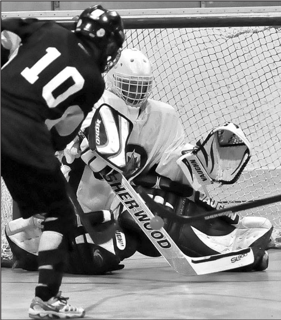
The last time CFB Shilo hosted prairie region ball hockey at Gunner Arena, the Stags prevailed in the final by grounding 17 Wing Winnipeg in the championship game.