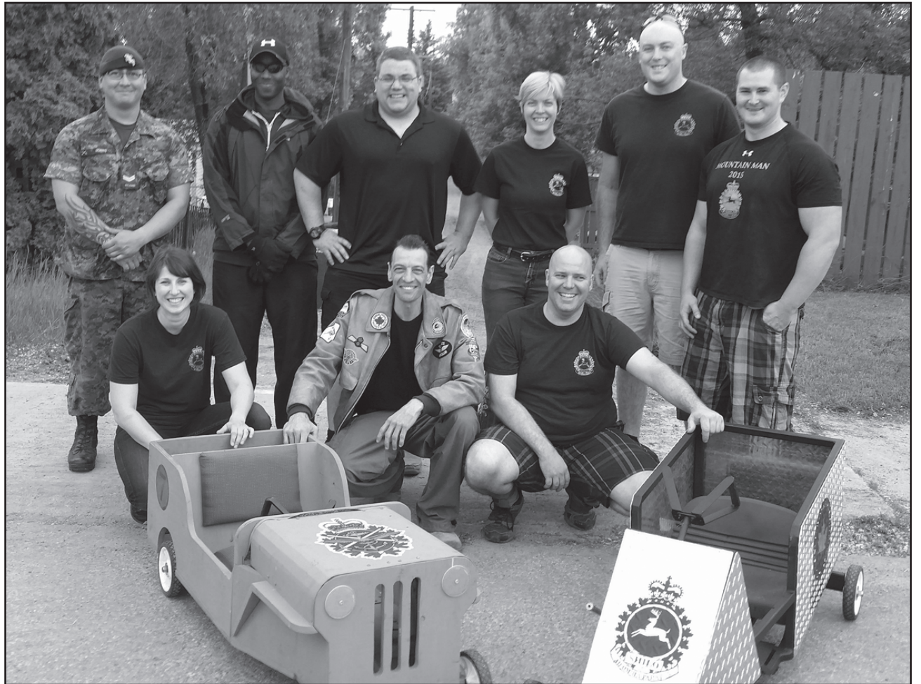
Annual Kiwanis event held in Brandon