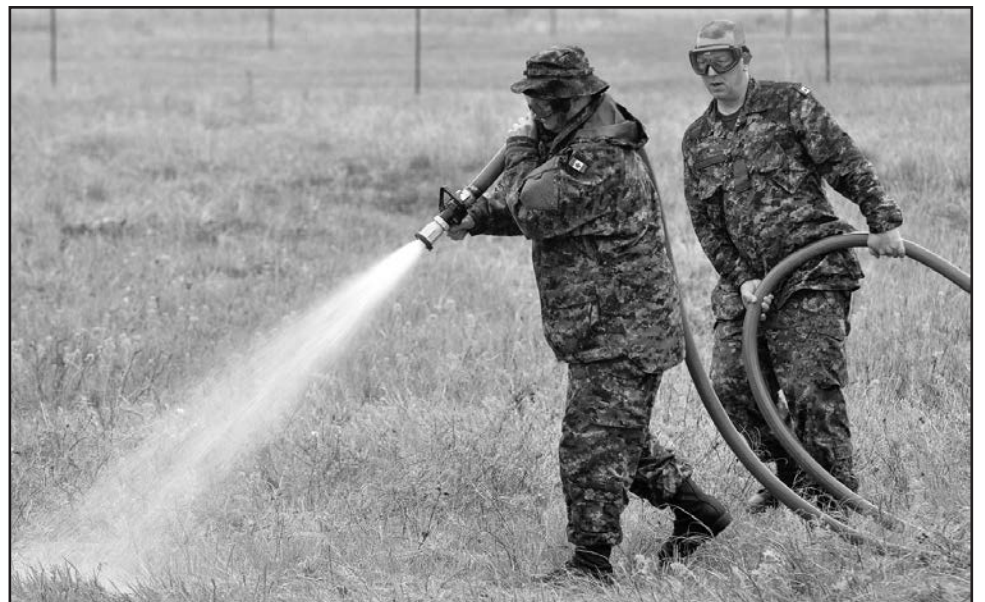
CFB Shilo's security force are often tasked to help range control with fire suppression. Here, they undergo some training to hone firefighting skills.