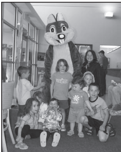
Over 130 people voted and the new name of the Shilo MFRC Mascot is Nutters! Thank you for being part of "Name That Mascot".