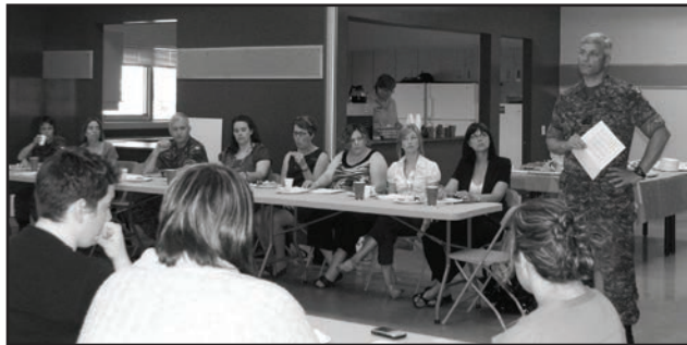
The perfect kick off to the AGM.