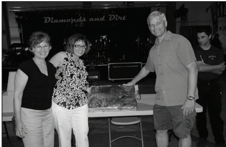
Lobster draw winners pose with the Base Commander and their 13 pound prize.

the Shilo and greater Westman community for their support. The money raised will go to support some very worthwhile causes within the Westman community. We hope that everyone had a good time and that we will see everyone next year.