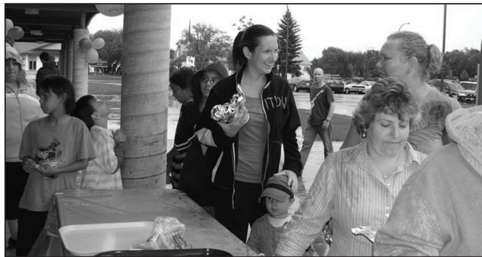
Rain wasn't holding back these families. Over 160 people attended this "soaked" BBQ.