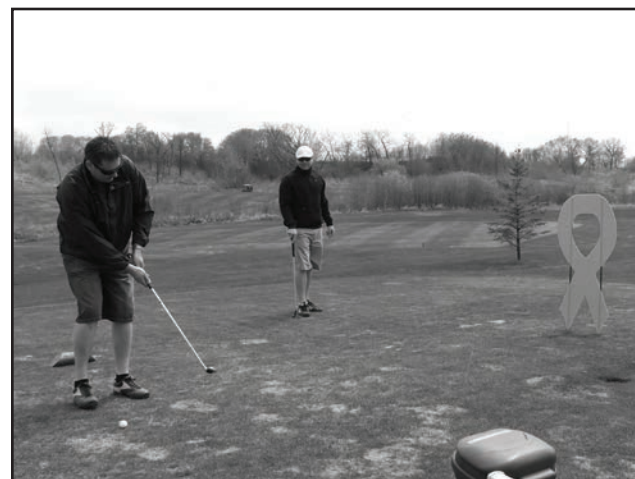
Setting up the perfect shot to chip the ball through the hole in order to earn extra ballots for the prize.

The day was cold and windy but that didn't dampen the golfer's good spirits. At the end of the day, almost everyone was red (from wind burn as well as the sun) and a to-