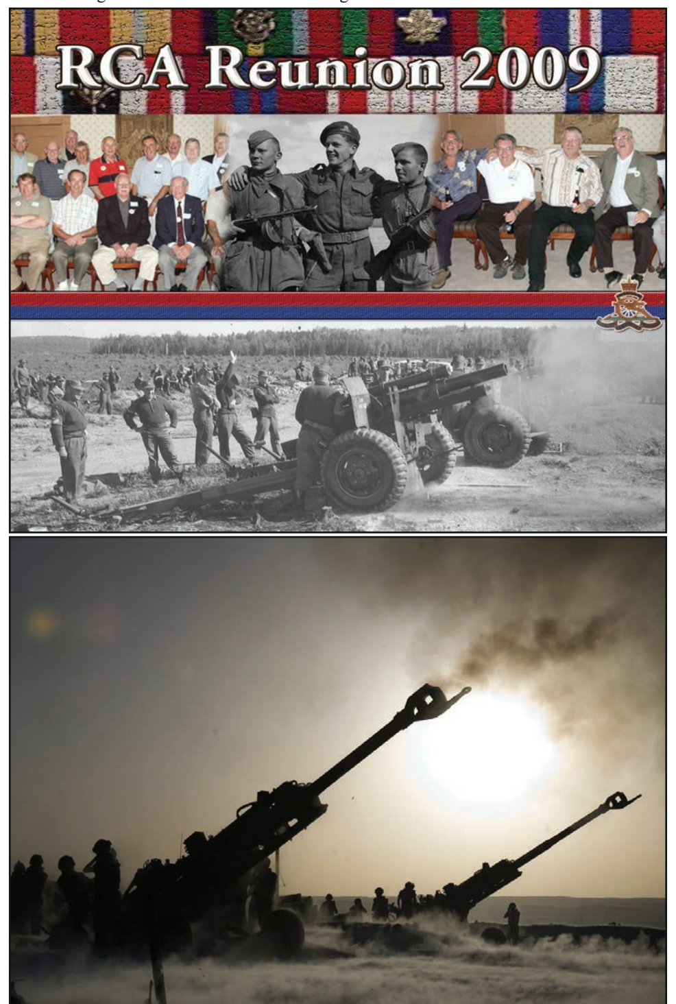
The M777 in Afghanistan 2007. The M777 is lighter and smaller, yet more powerful than any gun of its kind. The M777 will enhance the army's operational capability to provide indirect firepower at any time of the day or night, and under severe weather conditions.

The RCASA was successful and indeed surpassed its original aims. In addition to training numbers of fit soldiers with technical and leadership skills, many of these went on to become successful senior NCO's, Warrant Officers and Commissioned Officers. One of our Regimental apprentices went on to become a distinguished general officer. Our soldier apprentices were a highly spirited group of regimental members. Indeed, they still are. Over the years they contributed significantly to the success of the Royal Regiment of Canadian Artillery, the Army and the Canadian Armed Forces.