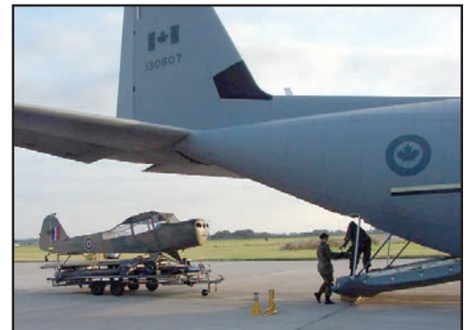
With its wings off, the Taylorcraft Auster Mark V was loaded into a Hercules for the trip to Canada.