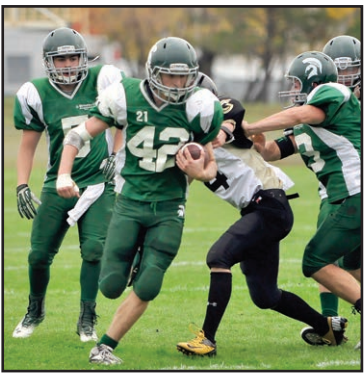
Spartans prevail 13-7 playing on Base field. Page 2