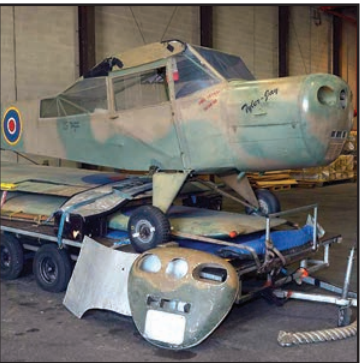
RCA Museum ready to welcome airplane. Page 8