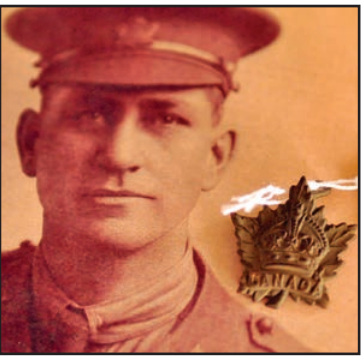
Camp Hughes attracts good turnout at trenches. Page 6