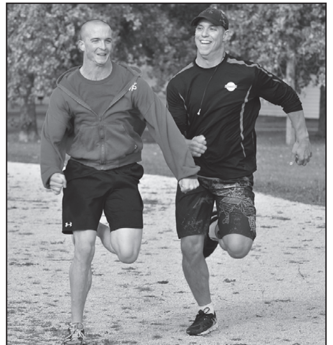
Terry Fox run participants sprint to the finish line at the Base track.