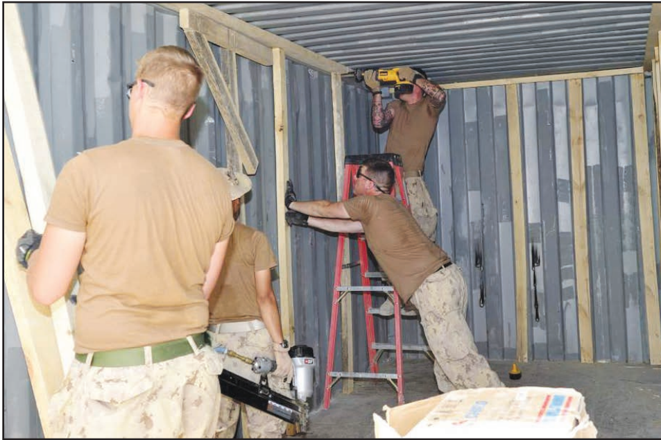
Above, members of the MTTF Engineer Squadron install interior walls in a sea container they are converting into a barrack room for Afghan soldiers. When finished, each accommodation seacan as seen below has bedspaces for up to 10 soldiers, with lighting, electric outlets, an air conditioner, and a base plate to support a wood stove for cooking and space heating.

The Seacan Accommodation Conversion (SAC) project began with a sample built by the engineers of Rotation 10, the last combat roto. MTTF engineers put together a plan based on