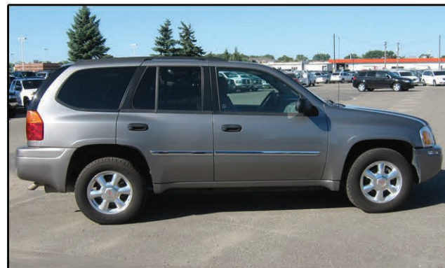
2007 GMC Envoy SLE V6, auto, loaded, navigation, sun- roof, 6 disc, 79,440 kms Stock# Z5904-1 $18,555 or $168.83 bi- weekly