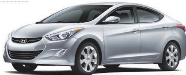
Limited model shown

OWN IT $144 1 BI-WEEKLY PAYMENT WITH 2.90% FINANCING FOR 60 MONTHS NO DOWN PAYMENT ELANTRA L 6-SPEED. DELIVERY & DESTINATION INCLUDED. HIGHWAY 4.9U/100 KM 58 MPG*