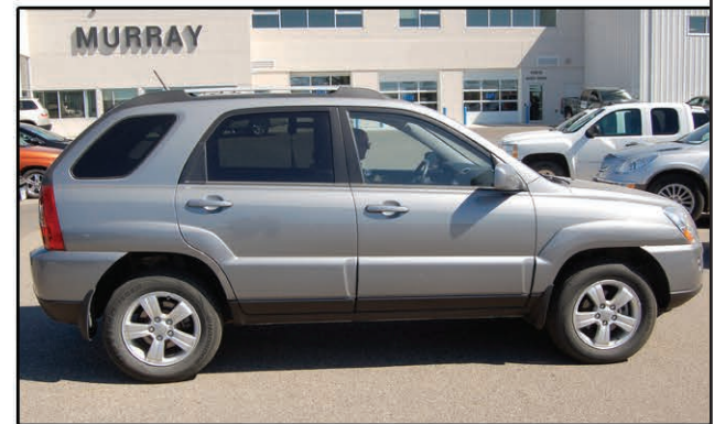
2010 Kia Sportage all wheel drive, LX model, V6, auto, loaded, CD only $30,814 kms Stock #M903-2 $26,475 or $204.51 bi-weekly