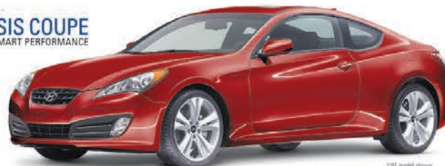
2011 model shown

OWN IT $204 1 BI-WEEKLY PAYMENT WITH 0% FINANCING FOR 60 MONTHS NO DOWN PAYMENT GENESIS COUPE 2.0T 6-SPEED. DELIVERY & DESTINATION INCLUDED. HIGHWAY 6.6U/100 KM 43 MPG*