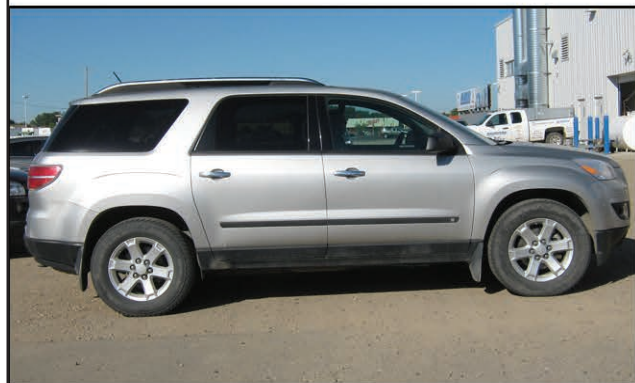
2008 Saturn Outlook XE all wheel drive, V6, auto, loaded, power sunroof, CD, 71,188 kms Stock #Z5918-1 $23,640 or $207.67 bi-weekly