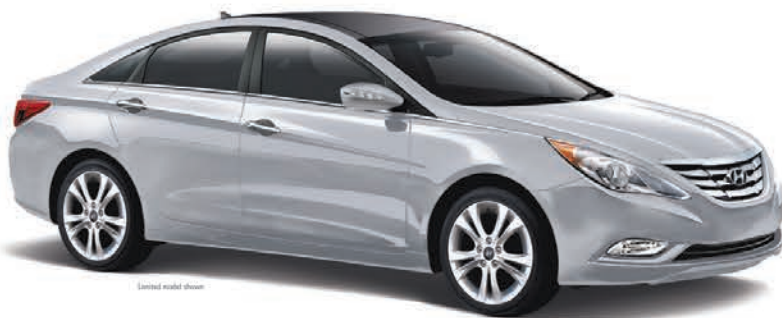
Limited model shown

5 REASONS WHY HYUNDAI IS THE BEST-SELLING CAR BRAND IN CANADA.