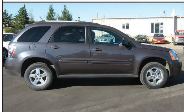
2007 Chevrolet Equinox LS FWD V6, auto, loaded, CD, alloy wheels, 67,635 kms Stock #Z5917-1 $15,920 or $145.62 bi- weekly