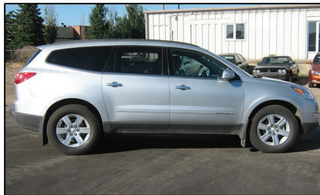
2009 Chevrolet Traverse LT2 all wheel drive, V6, auto, loaded, heated leather seats, sunroof Balance of GM extended warranty 74,458 kms Stock #M852-1 $26,975 or $208.29 bi-weekly