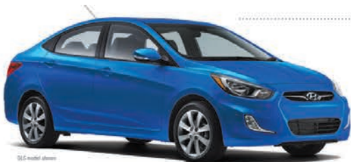
GLS model shown