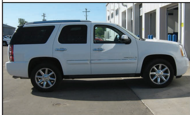
2008 Yukon Denali all wheel drive, V8, auto, loaded, naviga- tion, sunroof, power step boards 63,915 kms Stock #Z5913-1 $37,750 or $328.51 bi-weekly