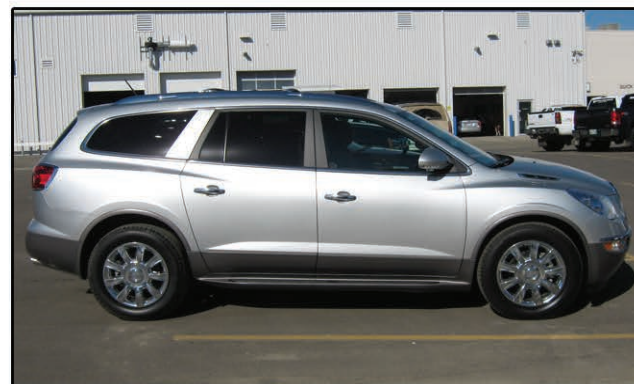
2009 Buick Enclave CXL2 all wheels drive, V6, auto, loaded, heated leather seats, 46,920 kms Stock #M939-1 $33,250 or $255.66 bi-weekly