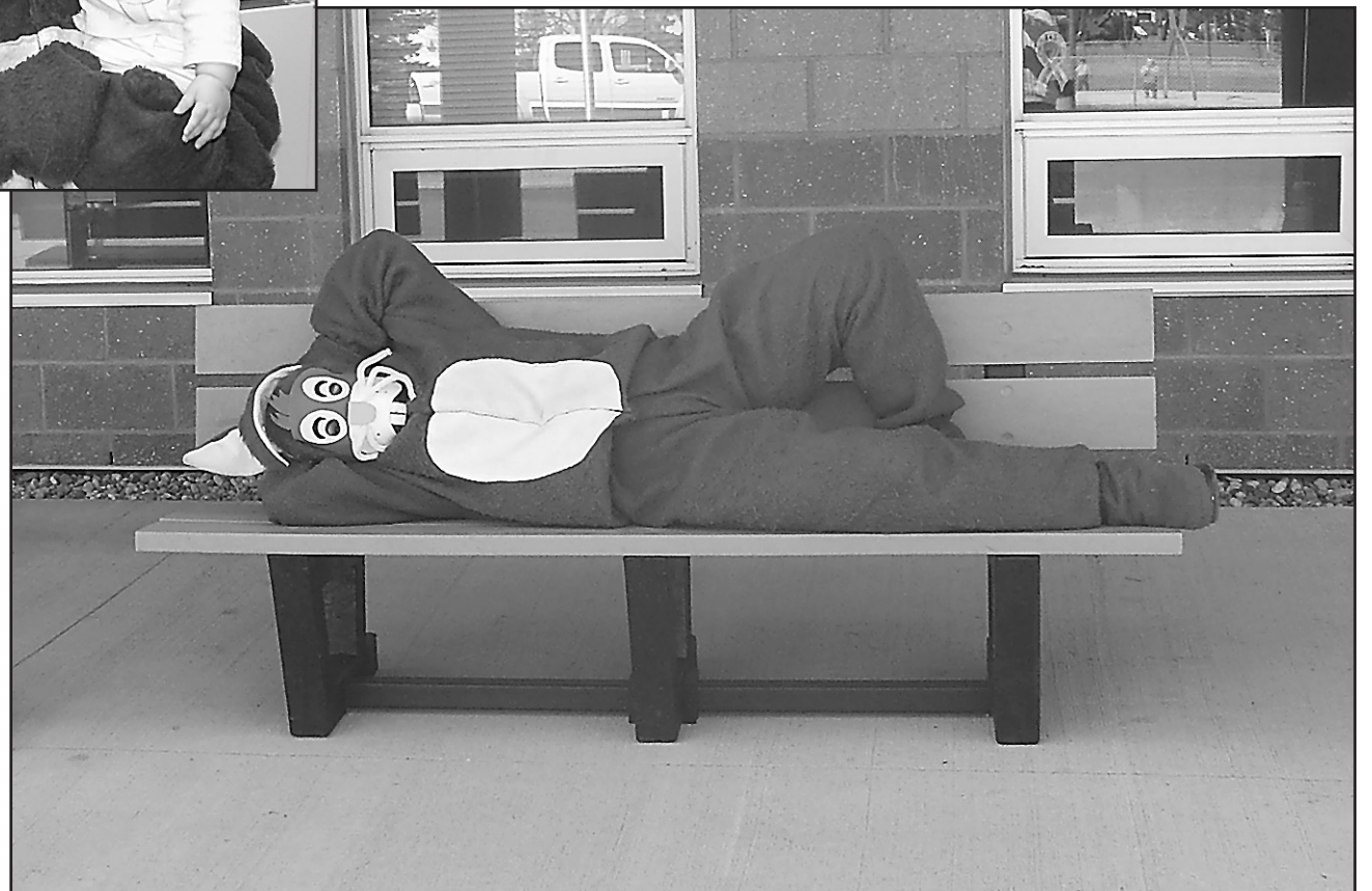
The last sighting of the bunny taking a rest before heading home.