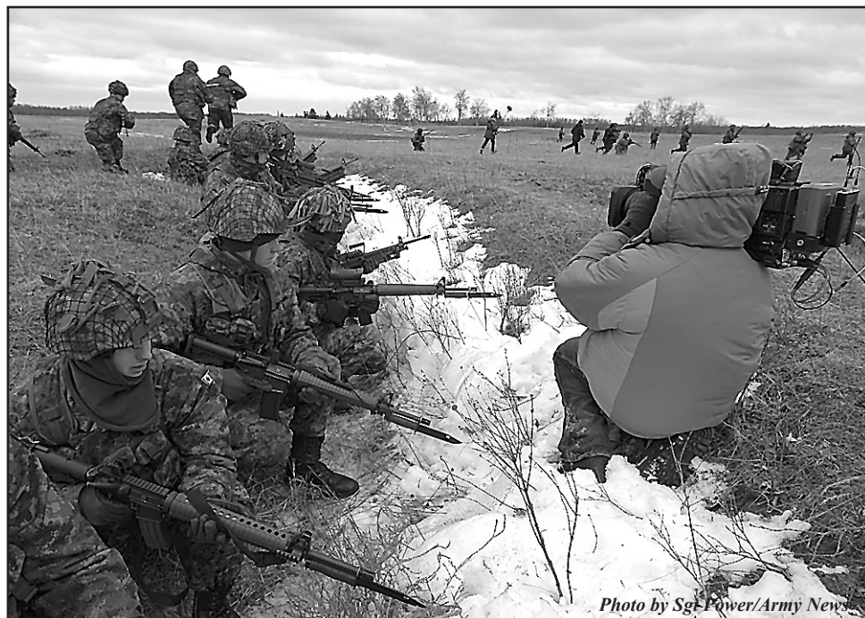
A cameraman from Yap Films gets a close-up of soldiers involved in filming a documentary on Vimy Ridge.